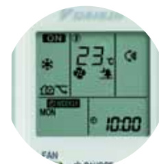
Infrared remote control (Standard) ARC452A1