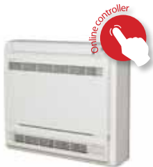
Indoor unit FVXS25,35,50F