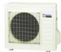
Outdoor unit RXS50K